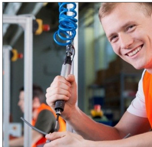
Creating a positive and open environment