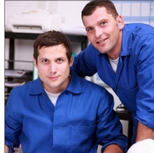
Preventing retaliation against those who speak up