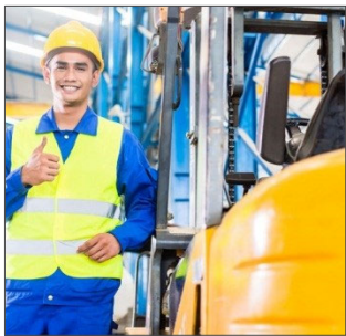
Helping your team members understand the concepts in our Code of Conduct