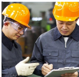
Holding team members accountable for their behavior